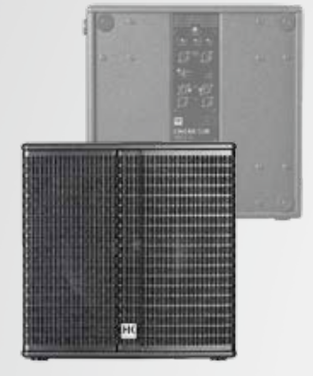
L SUB 1500 A