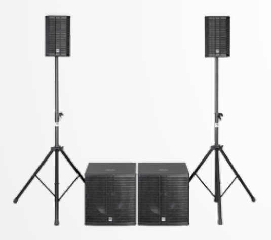
LUCAS 2K15 with L SUB 1500 A

In this setup, the two subwoofers are typically placed next to each other in a mono cluster, between the satellites. This results in homogenous sound dispersion in the bass and higher frequency ranges. The satellites stand to the left and right of the DJ booth, and are aimed towards the dancefloor. This is the ideal way to enjoy the most bass-rich LUCAS 2K sound.