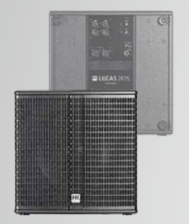
LUCAS 2K15 Subwoofer

L SUB 1500 A and the L SUB 1800 A are the perfect acoustic and aesthetic match for LUCAS 2K, and put even more bass power at your disposal.