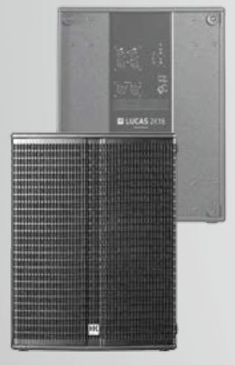
LUCAS 2K18 Subwoofer