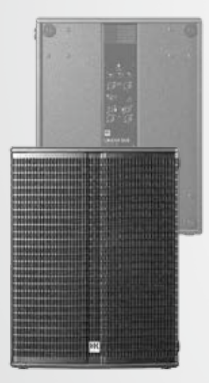
L SUB 1800 A